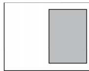
1/2 Page Ad: 4.25" w x 5.5" h